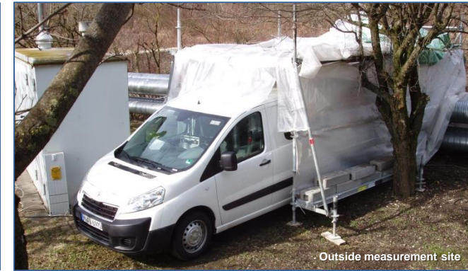
Outside measurement site