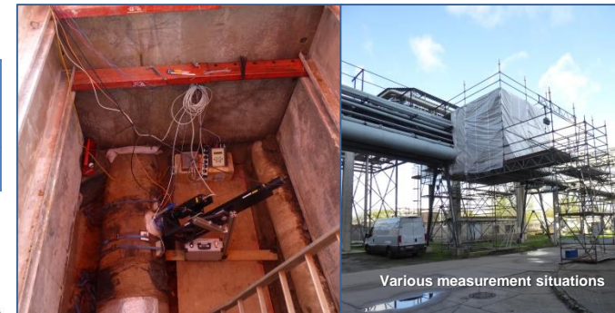
Various measurement situations

Until summer 2018 more than 170 flow sensors of district-heating and drink water supply were calibrated on-site. A quarter of the calibrated flow sensors showed a significant or rather high measurement error. These numbers confirm the importance and the benefit of the on-site calibration method for flow sensors.