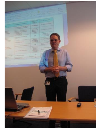
Giulio Volpi , Policy Officer, Renewables and CCS policy, European Commission, DG Energy